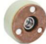
Step Chain Roller

GEY NO: ES01TS1004 OEM: Spec: 70*35 6202 Du