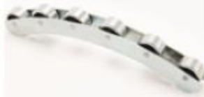
▶ Roller Assembly