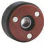
Step Chain Roller

GEY NO: ES01TS1003 OEM: Spec: 70*35 6202 Du