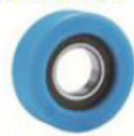
Step Chain Roller

GEY NO: ES01TS1006 OEM: Spec: 76*25 6006-2RS