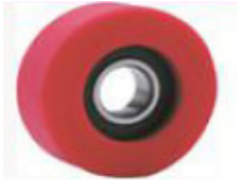
Step Chain Roller

GEY NO: ES01TS1001 OEM: 5P1P5380 Spec: \varnothing 70 x 25mm, 6204 red