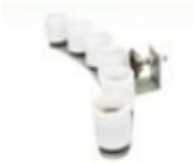
▶ Handrail Roller